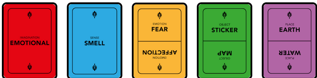
Figure 1: Example of a Mode Sequence game, using all five categories.

The experimental applications occurred between 2016 and 2018, involving open public workshops and classroom activities with design students at Pontifical Catholic University of Rio de Janeiro, Brazil. They happened in the following way: the cards and imagination sheets were presented to the players, groups of 4 to 5 people. Participants had 15 to 20 minutes to draw the cards and create stories. We observed and registered the proceedings in audiovisual form during the process. Once the card session was over, we had a debriefing session, talked about the experiment, and the participants made suggestions. Over these experiments, which generated dozens of stories and had more than a hundred students participating in them, more complex imagination sheets were developed, which incorporated more categories of cards. The dynamics of the experiments also changed; besides creating stories, we also asked narrative games to be created